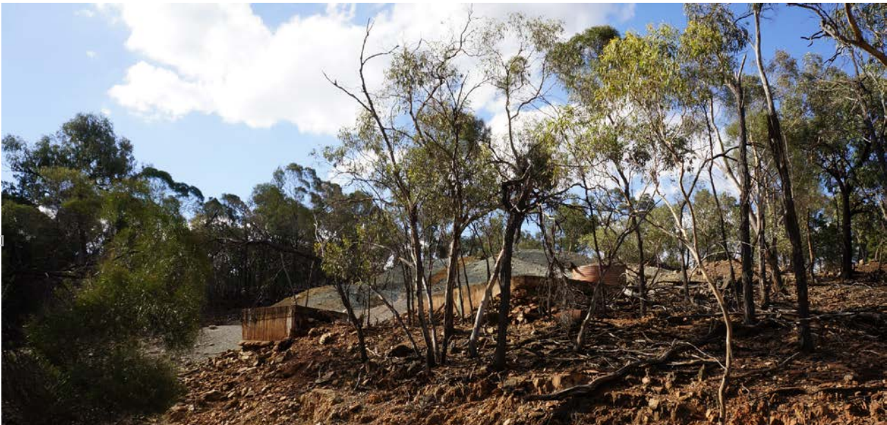
Figure 1: Historic Blind Calf Cu-Au Mine located in the NSW Lachlan Cu-Au Project area.