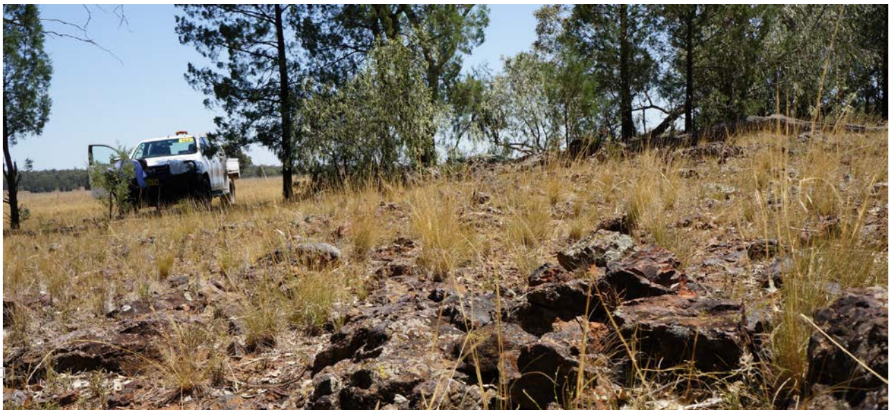
Figure 2: Outcrop sampling on NSW Lachlan Cu-Au Project.

Talisman geologists are currently completing initial reconnaissance geological mapping and rock chip sampling to verify copper, gold and base metal anomalies identified in historic data. (Figure 2).